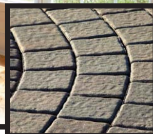
Try replacing an old driveway with easy-to-lay pavers. The old concrete can be used in a number of ways including a rustic pathway.

F loors, counters, sinks or anything with a surface can become worn or outdated. Whether you are remodeling or sprucing up, surfaces are a big part of the project.