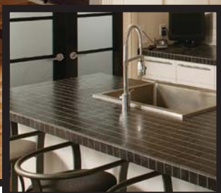
New tiles can add drama and value and are easy to do. Old, battered cabinets can come alive with a fresh coat of white paint.

Do-it-yourself hardwood flooring is easy. You can even consider staining alternating wood plank or a border on your existing floor to create a dramatic and inexpensive new look.