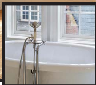
Old, stained or chipped tubs and sinks can be re-porcelained, often in your home, for a fraction of the cost to replace.